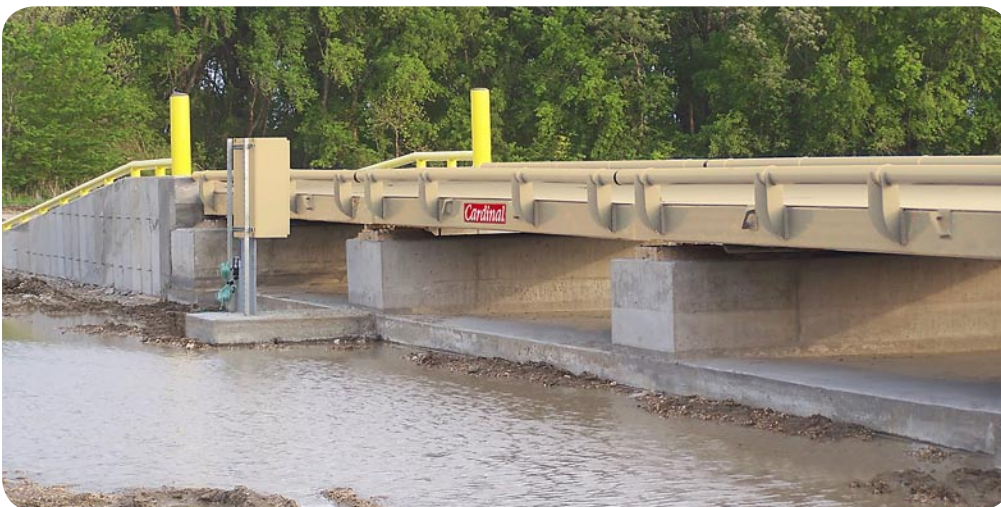
The Guardian truck scale can operate fully submerged underwater. This Guardian installation pictured here functions as a low-water bridge in addition to being a truck scale.